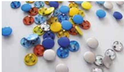
Steel cover caps – available powder-coated