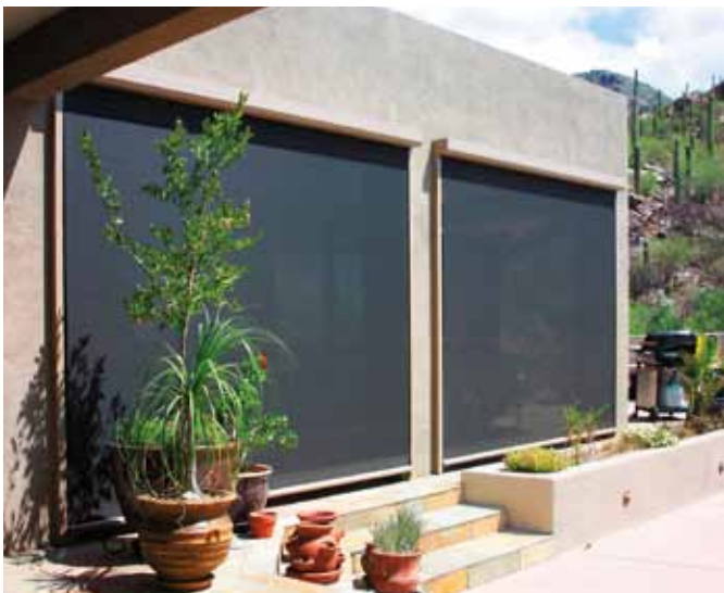
ALUKON - ZipTex the textile curtain

ALUKON offers a large variety of shading possibilities. Benefit of the available colours and materials to create your functional facade.