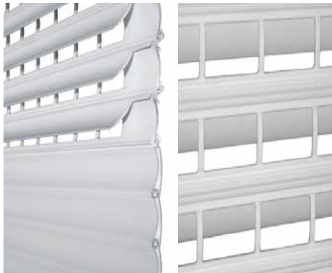
JalouRoll combined with roller shutter curtain an opened venetian blind function.